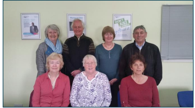
Members of the Management Board taken earlier this year

Our Management Board has monthly meetings, which are open to all members to attend. Details of Board meeting dates and times are publicised on our website and in our e-alerts. Healthwatch members are able to submit questions in advance. In addition, the minutes of our Management Board meetings are published on our website, with links included in our e-alerts.