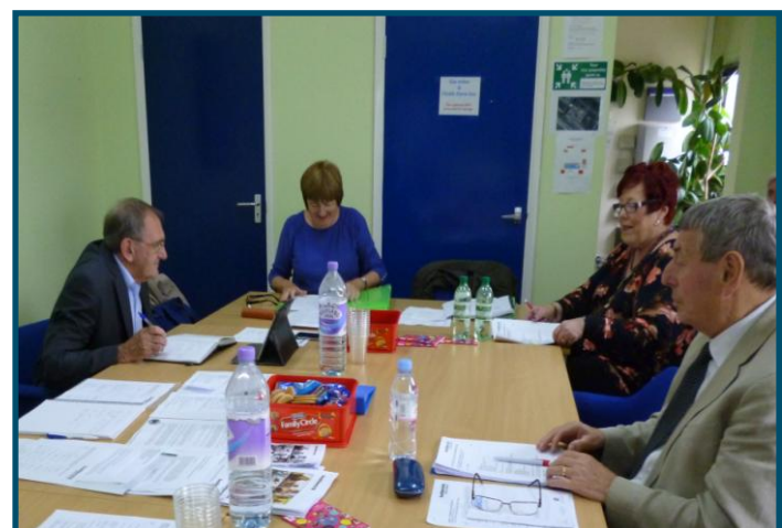
Members of the board during a working meeting

Our volunteers are invited to attend and contribute to Management Board meetings. Volunteers also contribute to our wider work through writing reports that inform our work.